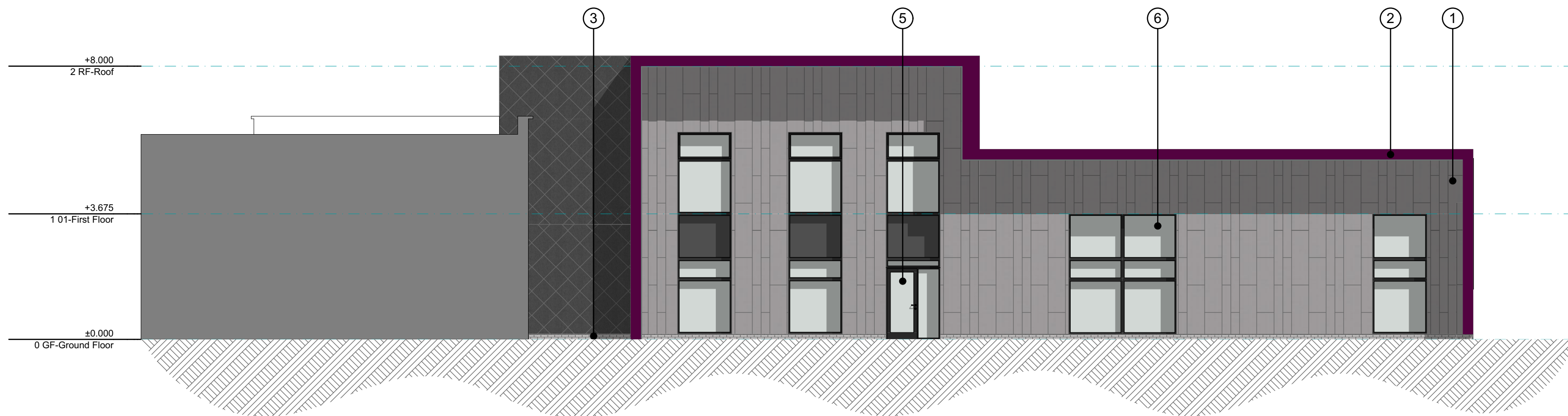
E-03 Elevation 1:100