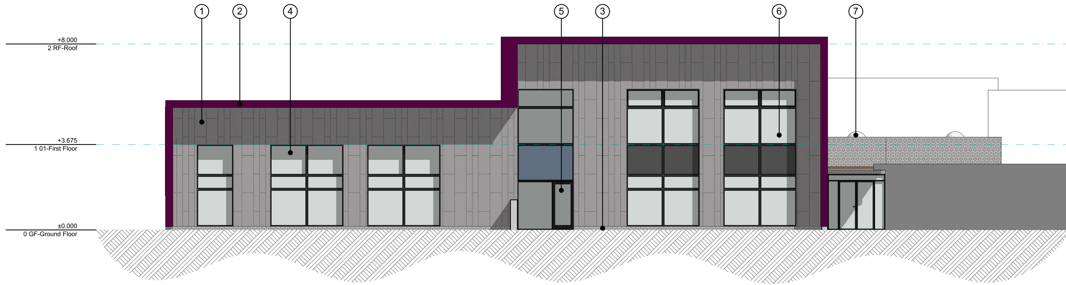
E-01 Elevation 1:100

This document and its design content is copyright ©. It shall be read in conjunction with all other associated project information including models, specifications, schedules and related consultants documents. Do not scale from documents. All dimensions to be checked on site. Immediately report any discrepancies, errors or omissions on this document to the Originator. If in doubt ASK. Where the document has been printed at a paper size not indicated on the drawing the user should be aware that scales will also vary and care should be taken when viewing these drawings.